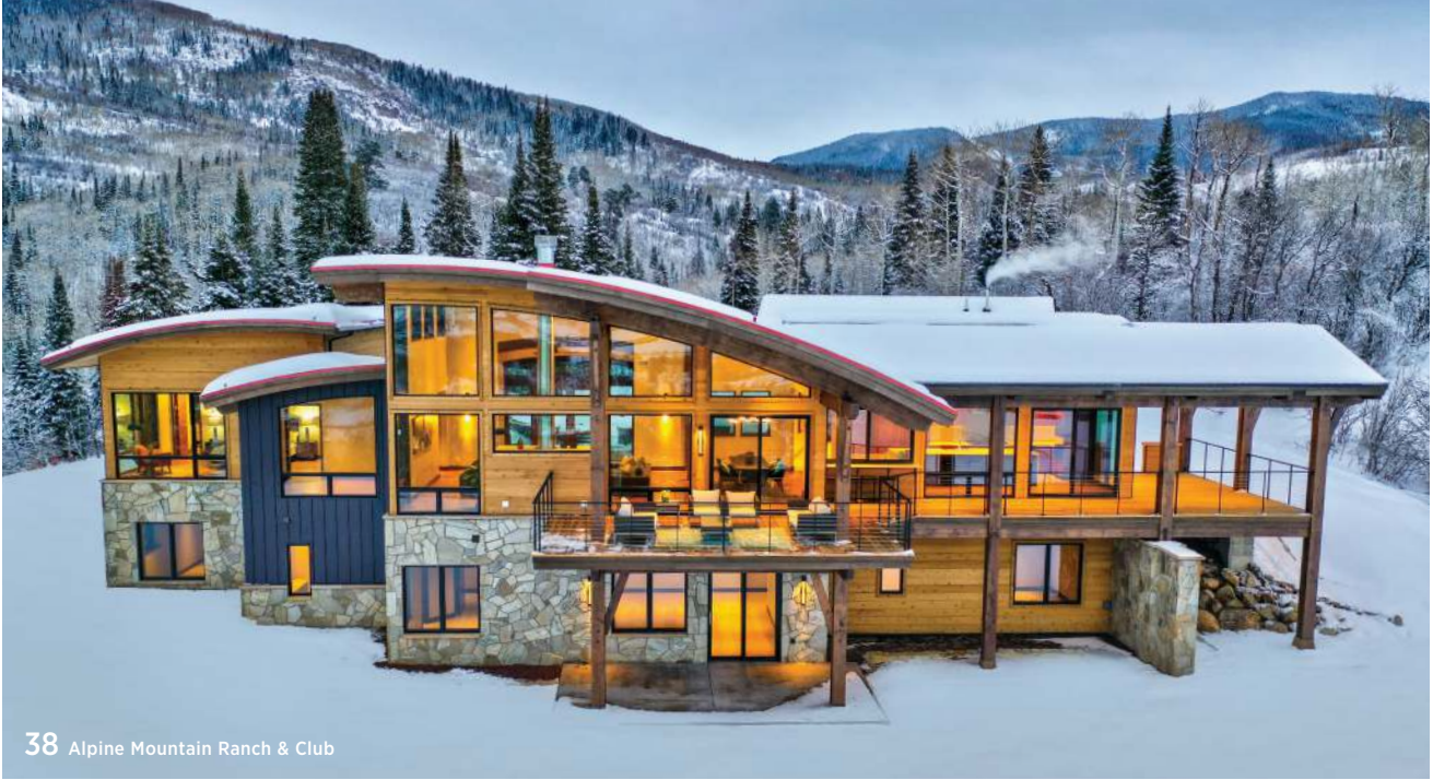
38 Alpine Mountain Ranch & Club