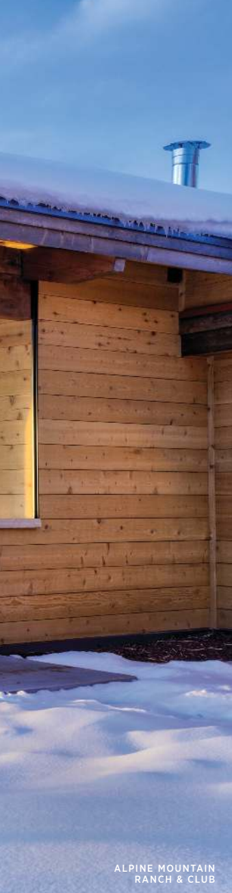
ALPINE MOUNTAIN RANCH & CLUB