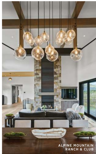
ALPINE MOUNTAIN RANCH & CLUB

Hot springs are a must. Steamboat was named by early-19th century French trappers who thought they heard a steamboat whistle on the Yampa River. It was, in fact, steam from the town's natural mineral springs. Old Town has indoor and outdoor pools and waterslides, great for kids. Strawberry Park is more remote (about 30 minutes out of town with no cell service), surrounded by trees and mountains. After dark, it's adults only and clothing