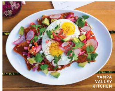
YAMPA VALLEY KITCHEN