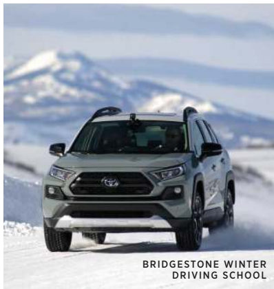
BRIDGESTONE WINTER DRIVING SCHOOL