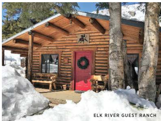
ELK RIVER GUEST RANCH

► During the winter season (December 24 through March 25), United Express has daily non-stop flights from Los Angeles (LAX) to Yampa Valley Regional Airport (HDN). From there, it's about 27 miles into town. P