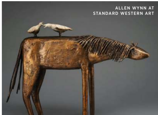
ALLEN WYNN AT STANDARD WESTERN ART

period details. For an alfresco space to call your own, swing for the generously sized two-bedroom penthouse with a roof terrace. Elk River Guest Ranch ( elkriverguest.com ), surrounded by the Medicine Bow-Routt National Forests, has five rustic-cozy log cabins (two-night minimum) and offers horseback-riding adventures, snowmobiling, dogsledding, and a sport-kayaking school. It's so quiet you can hear elk bugling and wind blowing through the treetops, and the stars feel close enough to touch, just 30 minutes from Steamboat. If you fall in love with Steamboat and want to live here (many Californians