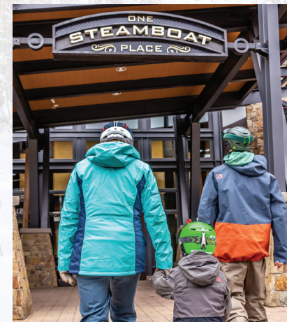
ALPINE MOUNTAIN SUMMIT CLUB

SLEEK, CONTEMPORARY ARCHITECTURE BLENDS WITH NATURAL BEAUTY IN ONE OF COLORADO’S MOST CHARMING WESTERN DESTINATIONS