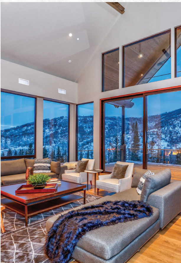
PICTURED: DESIGNS BY RUMOR DESIGNS