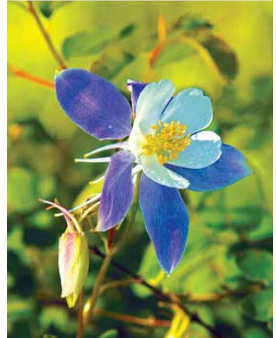
CLOCKWISE FROM TOP LEFT: Hilltop and ridge-top homesites offer magnificent views. Columbine—Colorado's state flower—bloom in profusion in the meadows on the ranch, as do larkspur, gentian, phlox and bluebells. The barn, always the center of ranch and cowboy life, houses the Equestrian Center. Homeowners can board their own horses or reserve one of the ranch's horses for rides on the more than 5 miles of trails on the property.